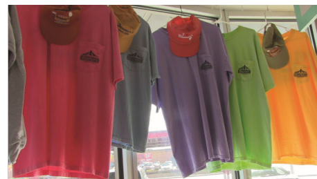
Doumar's is so popular it sells themed clothing