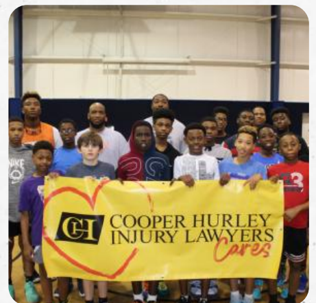
We sponsor many sports and athletics teams that allow kids to develop their talents and reach their full potential. Last year, we were happy to give a donation to Ground and Pound Athletics, a Portsmouth-based sports team.