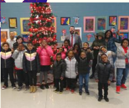
Mrs. Lenthia L. Willie-Clark Southside STEM Academy at Campostella, Norfolk

We're proud to have supported our schools through donations, sponsorships, and scholarships every year since our founding. Along the way, we've met some extraordinary school principals who work diligently every day to support Hampton Roads students. Here are a just few: