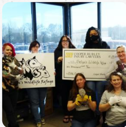
Evelyn's Wildlife Refuge is a local nonprofit organization that takes in 600+ injured, orphaned, and sick wildlife animals a year to be rehabilitated with the intent to release them back into the wild. In 2019, they won our Vote for a Cause contest.